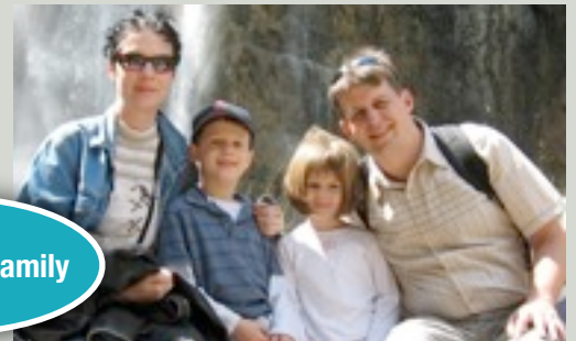
The Szabad Family

For more about Virag's book, visit: http://www.dpibooks.org